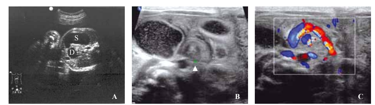
Fig. 1. Ultrasonic examination of duodenal obstruction. A: Prenatal sonographic evaluation demonstrated a typical fetal double-bubble signal (S: stomach, D: duodenum); B: The transverse sonographic imaging indicated the alternating rings of low and high echogenicity at the base of mesentery due to volvulus (cocentric circle sign); C: Color doppler ultrasonograph revealed inversion of the superior mesenteric artery and vein (the whirlpool sign).